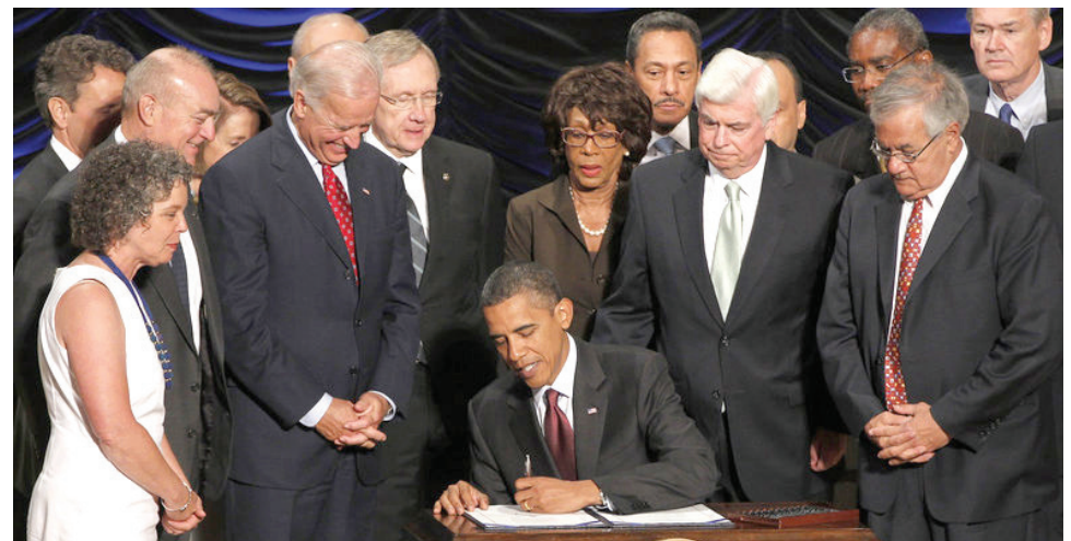
President Obama signs the Dodd-Frank financial overhaul bill in Washington on July 21, 2010. Five years later, debate over the effectiveness of the legislation continues.

"And just like Obamacare, Dodd-Frank has left us with fewer choices, higher costs and less freedom," Hensarling said. "It's evident that Dodd-Frank has made us less prosperous and less free. If